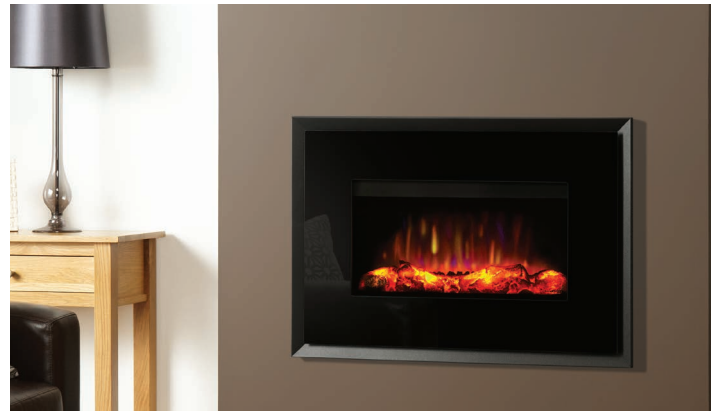
Evoke Black Glass Fascia