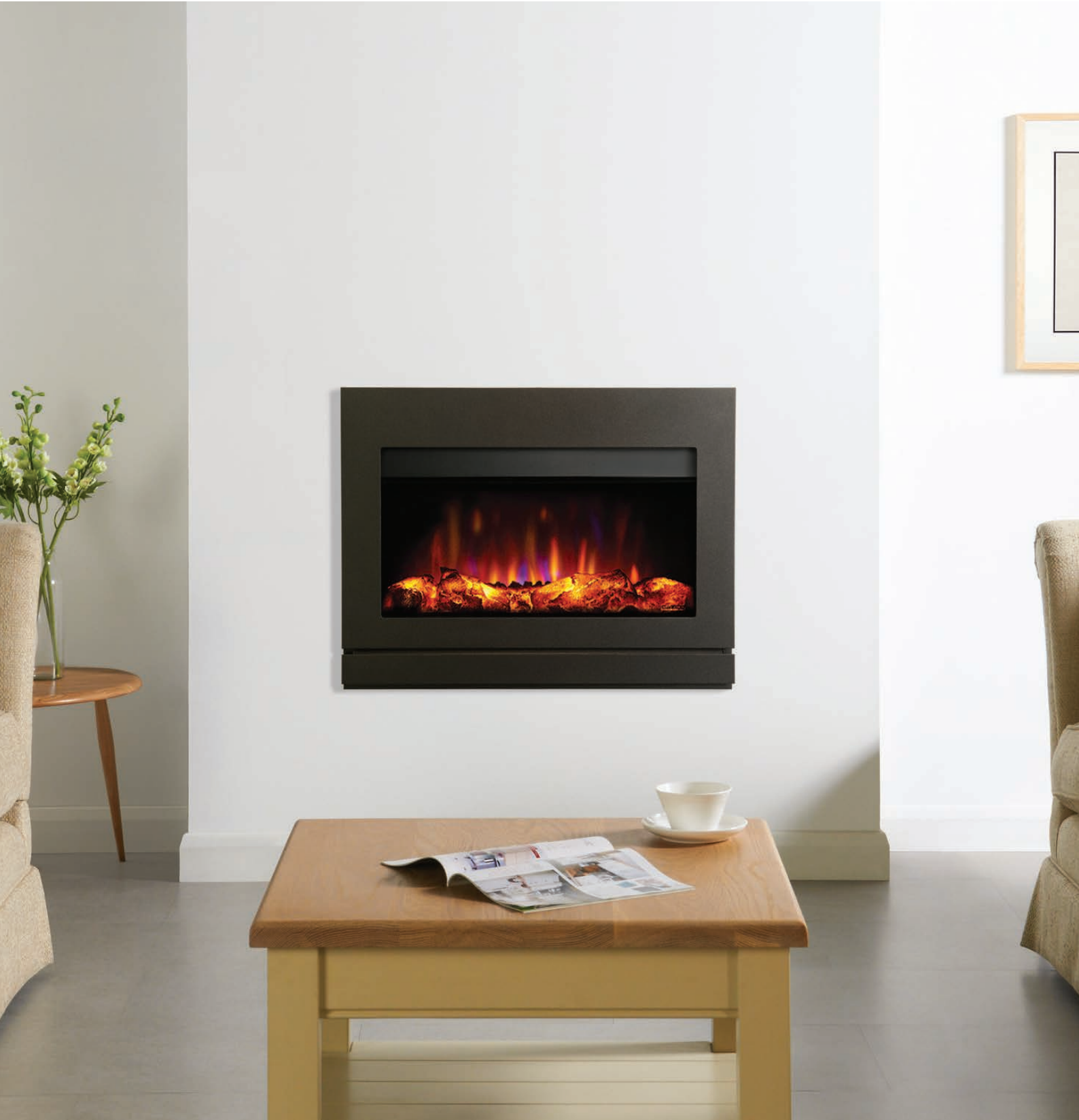
Riva2 670 Electric Designio2 Steel Fascia - Graphite