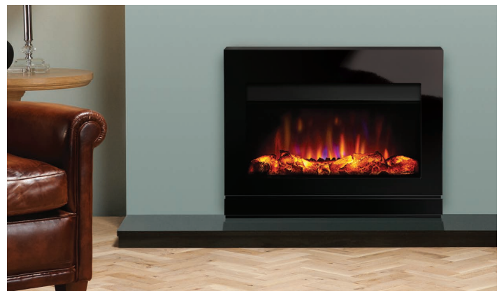
Designio2 Black Glass Fascia