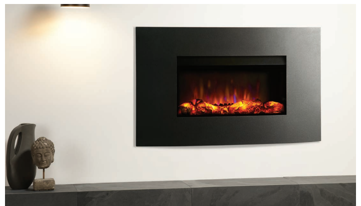
Verve XS Fascia - Graphite

The information on these pages is to assist you in your choice of a suitable Gazco fire. This is not intended to be all the information required for installation. This information, along with minimum distances to combustible materials, can be obtained from your local Gazco retailer or you can download the full installation instructions from the website at gazco.com.au