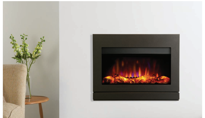
Designio2 Steel Fascia - Graphite