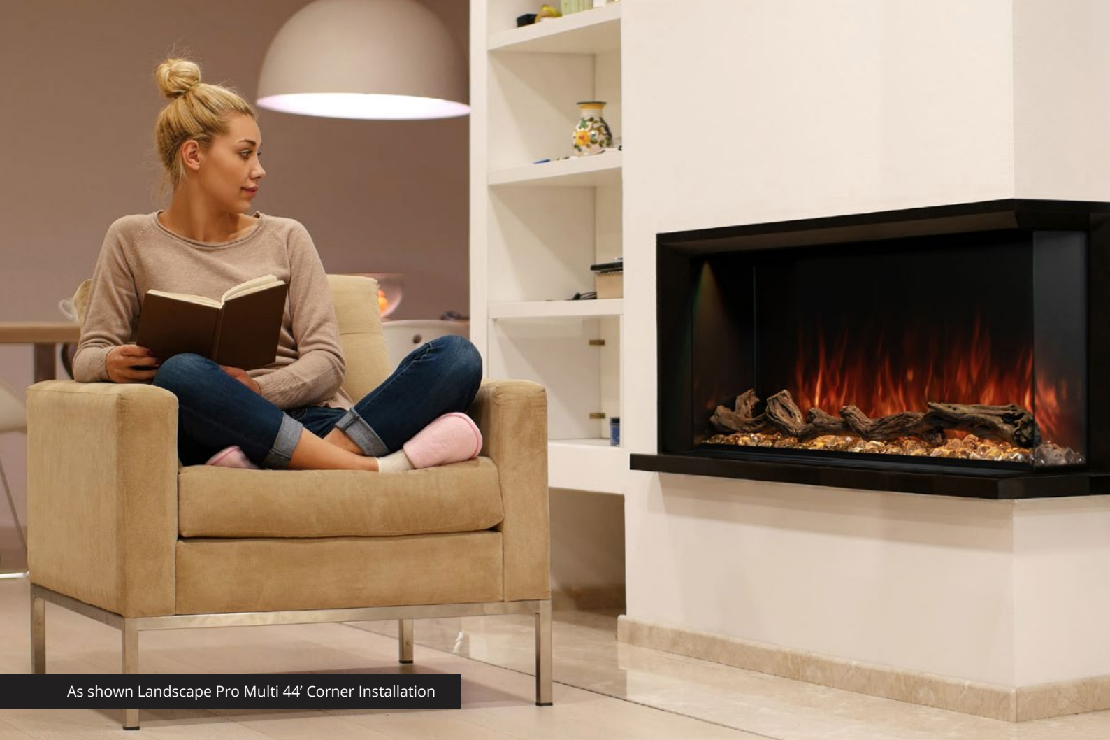
As shown Landscape Pro Multi 44' Corner Installation