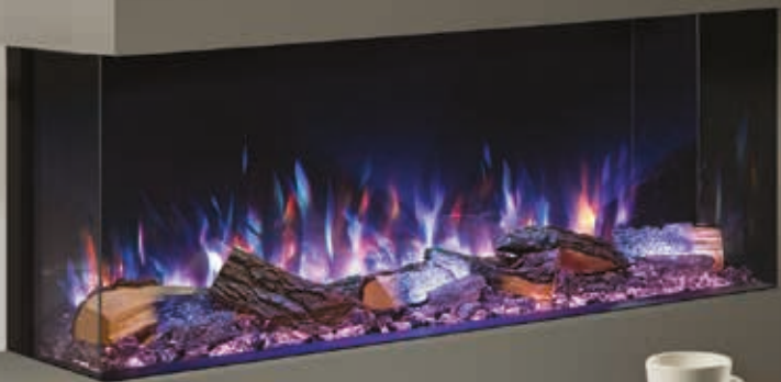
Avanti 110RW with Split Oak Log-effect, installed as a two-sided corner fire.