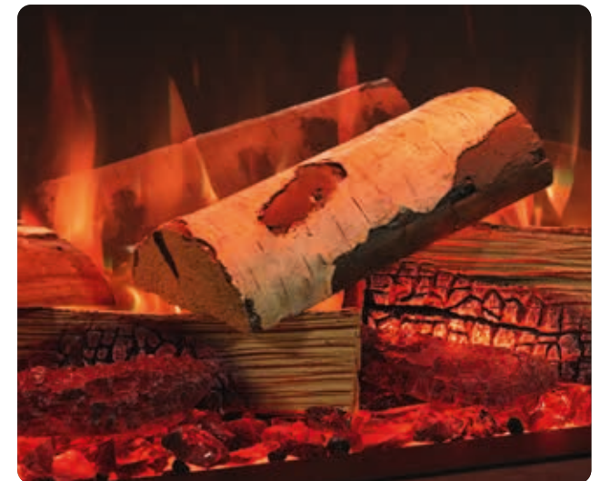
Optional Split Silver Birch Log-effect