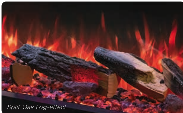
Split Oak Log-effect

See pages 3, 5 & back cover for additional images